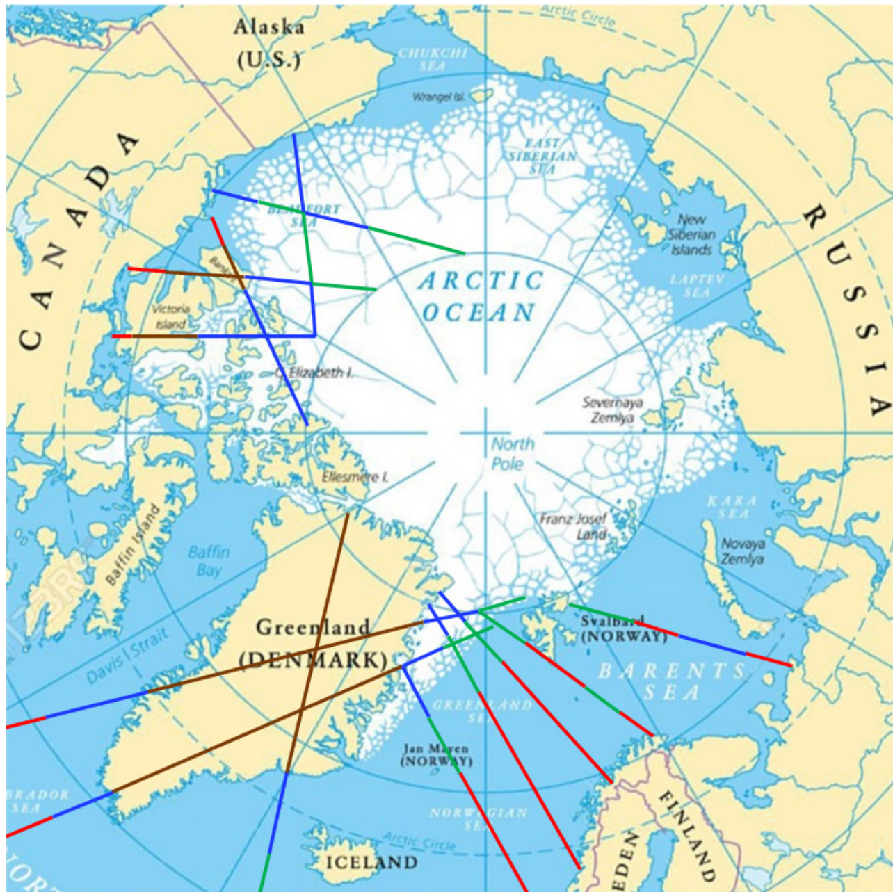
Figure 2. Results of the classification of the Arctic ice field on the base of satellite radiometers data (8–9 February 1984). Ice-free water is shown with red lines; one-year ice is shown with green lines; multi-year ice is shown with blue lines; pack ice is shown with brown lines.