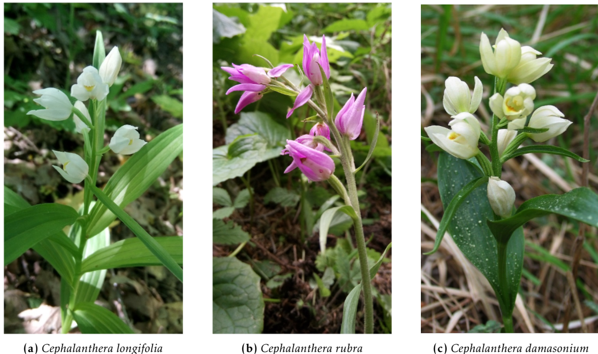
(a) Cephalanthera longifolia