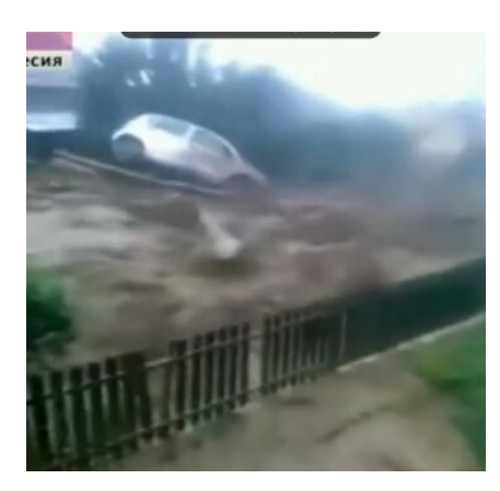
Figure 1. Consequences of mudflows in Zelenchuksky and Urupsky districts of the KChR on July 1, 2015 [ Kyul et al. , 2021b].