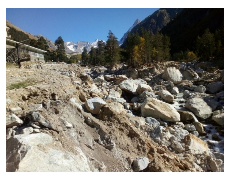
Figure 6. Consequences of the breakthrough of the lake and the descent of the mudflow in the gorge of the river Adylsu.