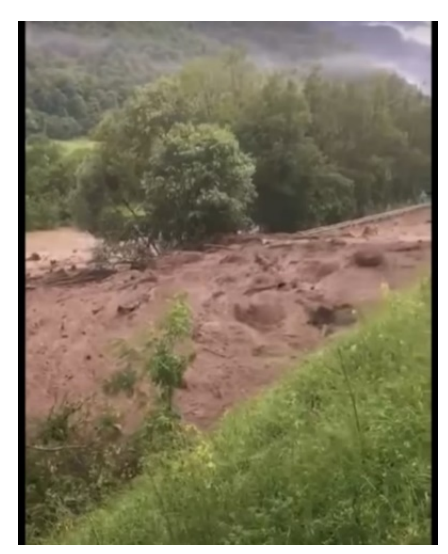
Figure 2. Mudflow descent along the left tributary of the Teberda River to the federal highway "Cherkessk-Dombai" on 06/16/2018 [ Kyul et al. , 2021b].

Also, based on the results of field trips, schematic maps have been compiled, with GPS points applied (for example, Figure 3).