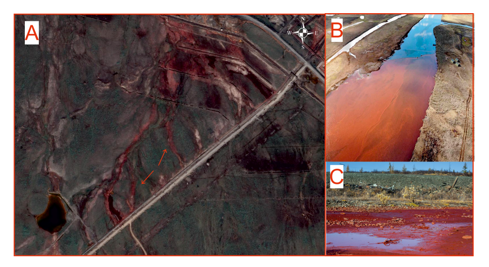
Figure 2: Consequences of a failure of a pipeline between the processing plant and the tailings. The delves formed by mine waters are marked with arrows. A – overview [ Google , 2022], B – failure of 2020 at Ambarnaya river [ Pettit , 2020], C – failure of 2016 at Daldykan river [ Tribune , 2016].